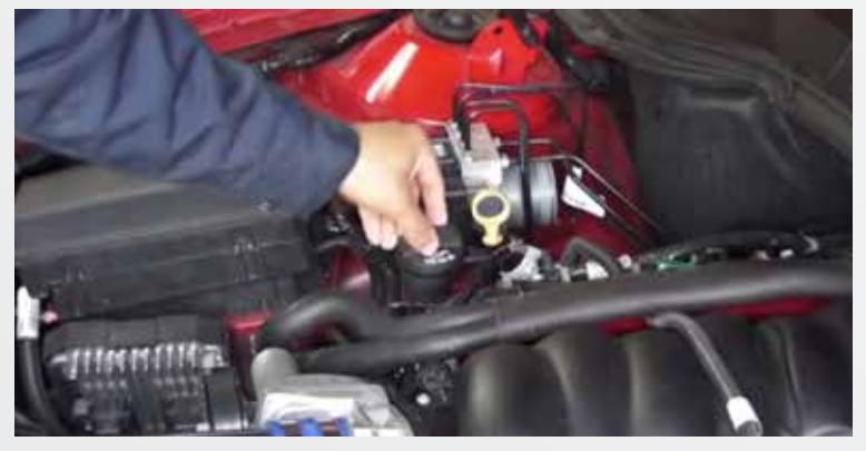
Remove the oil cap and the decorative engine cover by gently pulling up to pop it off the rubber mounts. Replace the oil cap to prevent debris from contaminating the oil.