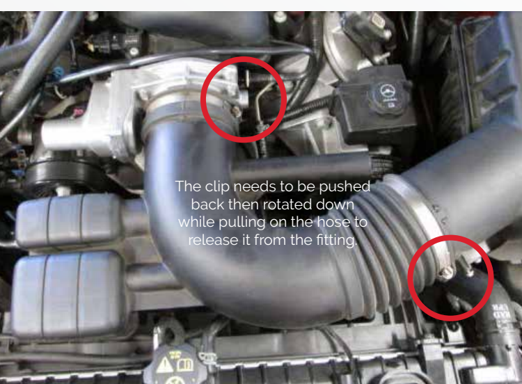
Loosen the clamps at the throttle body and factory air box.